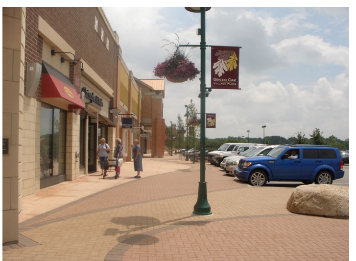
Design standards can result in a "main street" setting at Corridor G