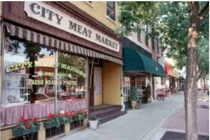
Continued facade improvements and site design features will strengthen the character of the Bridge Rd. shops